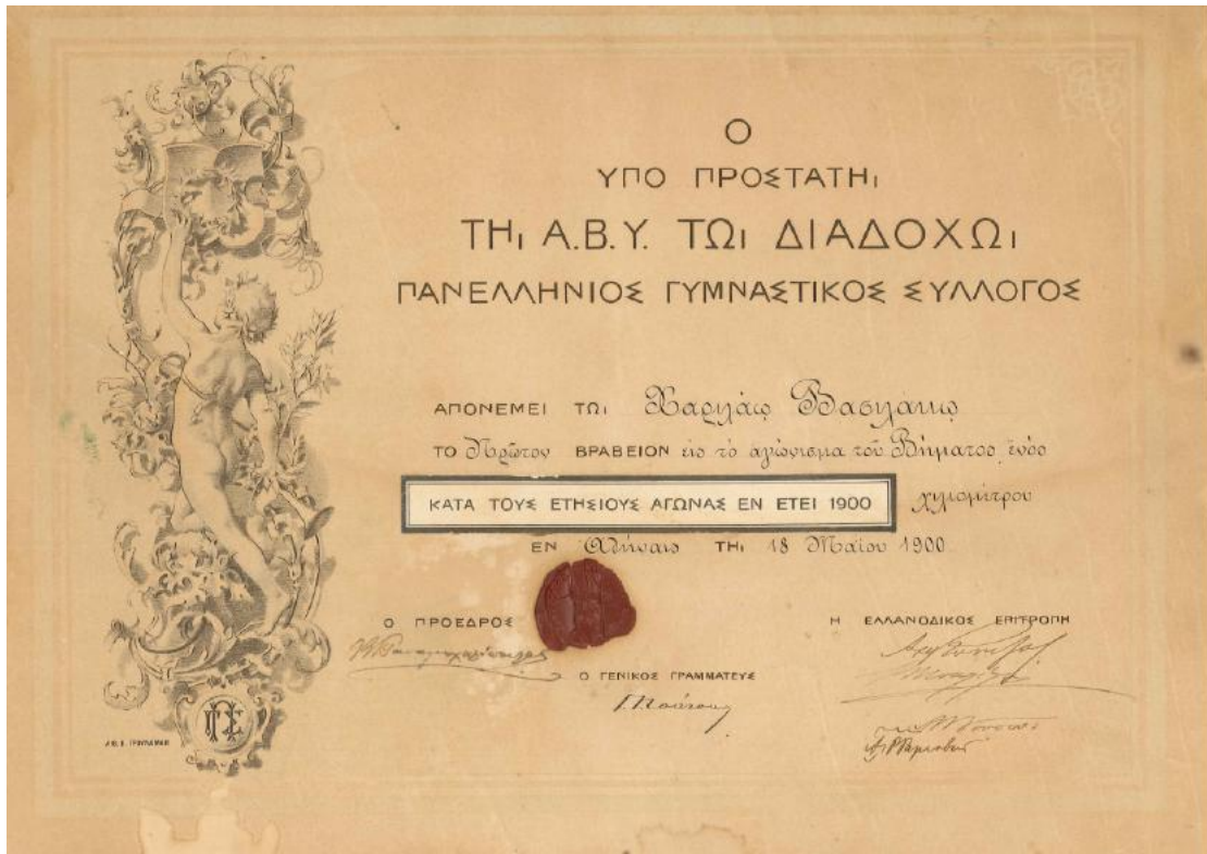
The honorary diploma for winning the first Race Walk in Greece – May 18, 1900 It is displayed in the Marathon Run Museum in Marathon City.

As an athlete he participated successfully in numerous races.