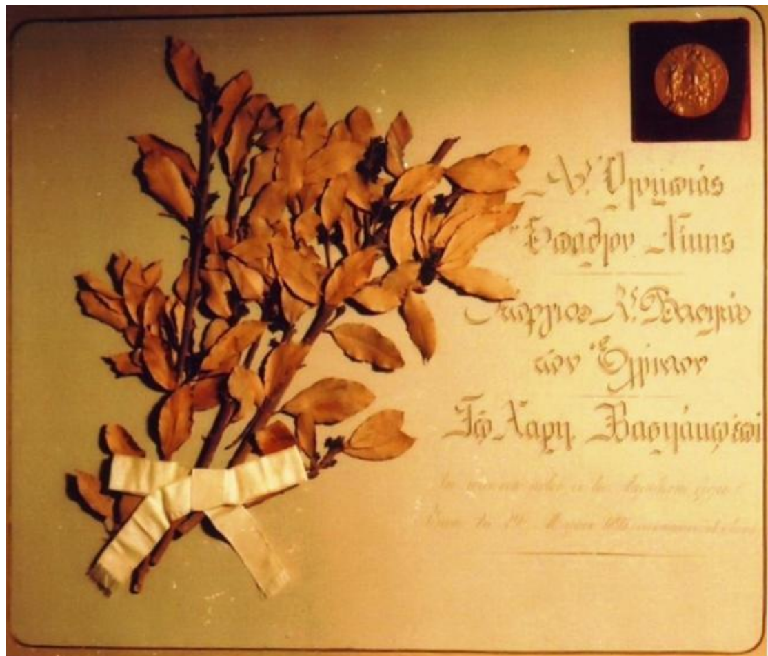
The Olympic Metal from the 2 nd Place in the Marathon Race, the honorary diploma and unique laurel wreath that has survived from 1896. Exhibited in the Modern Olympics Museum in Ancient Olympia.

To this day he remains the youngest Olympic Winner Medalist in the Marathon Race.